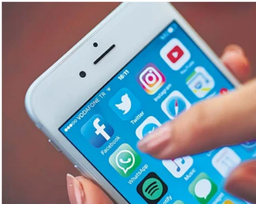
While companies benefit from employee-generated content, or EGC, they need to have at least some control over the content posted on their websites.

EGC is recent concept in India after its success in the West. Piyush Agrawal, co-founder of influencer management