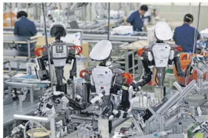
Deeptech funds put in between $250,000 and $1.5 million when they enter startups at the pre-seed and seed stage.

Elevation Capital has made one investment this year, a $10 million Series A with aerospace component maker Jeh Aerospace. However, the fund has said that they now have more